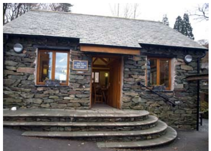
Old School Room tea shop